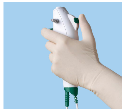
aScope™ 4 RhinoLaryngo Intervention is always comfortable to hold thanks to its lightweight and ergonomic design