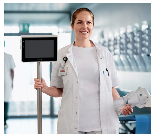
Ambu® aView™ on IV pole - small footprint and easily moved