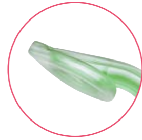
Thin and soft inflatable cuff