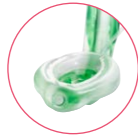
Large gastric channel