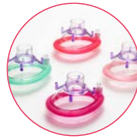
Scented mask variants