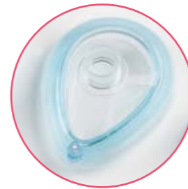
Clear dome and anatomical shape