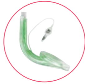
Original anatomical curve