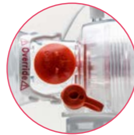
Pressure limiting valve and override clip