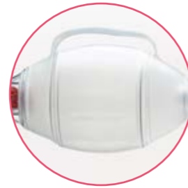
Integrated handle, SafeGrip surface and TPE compression bag