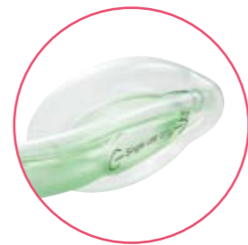
Large flat backplate