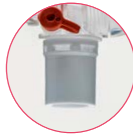
Swivel connector and m-port