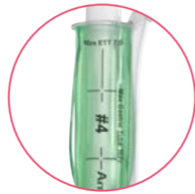
Bite absorption area