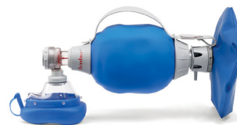
Mark IV Size Adult, shown with an attached silicone face mask

The Ambu Mark IV resuscitators comply with EN ISO 10651-4:2002.