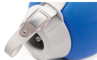
Mark IV nameplate