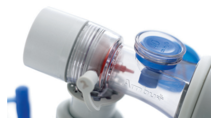
Integrated pressure-limiting valve with override cap on Ambu® Mark IV Size Baby for patient safety